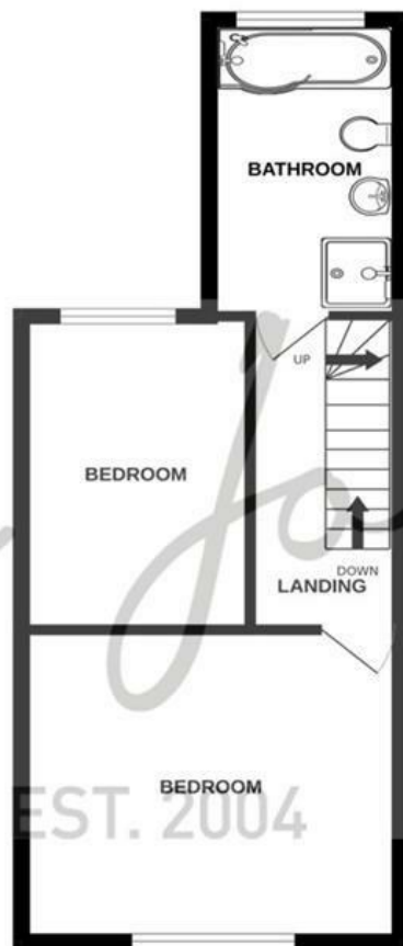
1ST FLOOR 34.5 sq.m. (371 sq.ft.) approx.