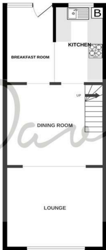
GROUND FLOOR 41.0 sq.m. (442 sq.ft.) approx.